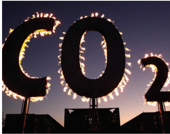
Nations must commit to more than the lowest common denominator.

If, on the other hand, nations agree to halve global emissions by 2050 from 1990 levels, then global industrialized emissions will need to decline on average 3.0–3.5% (compared to 2000 levels) in each year between 2020 and 2050 for the cases analysed above. Such reductions would require unprecedented political will to drive the necessary technological and economic innovation. For comparison, building all new power plants 100% emission-free would result in only a 0.7% annual reduction in global emissions until 2050. Even with halved emissions by 2050, the temperature increase would be